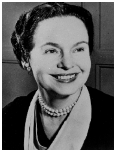
Oveta Culp Hobby, Secretary of Health, Education, and Welfare helped President Eisenhower achieve passage of his bill to admit an additional 10 million Americans to the Social Security system in 1954.

are supposed to save enough to take care of themselves.' In this modern industry, dependent as we are on mass production, and so on, we create conditions where that is no longer possible for everybody. So the active part of the population has to take care of all the population, and if they haven't been able during the course of their active life to save up enough money, we have these systems."